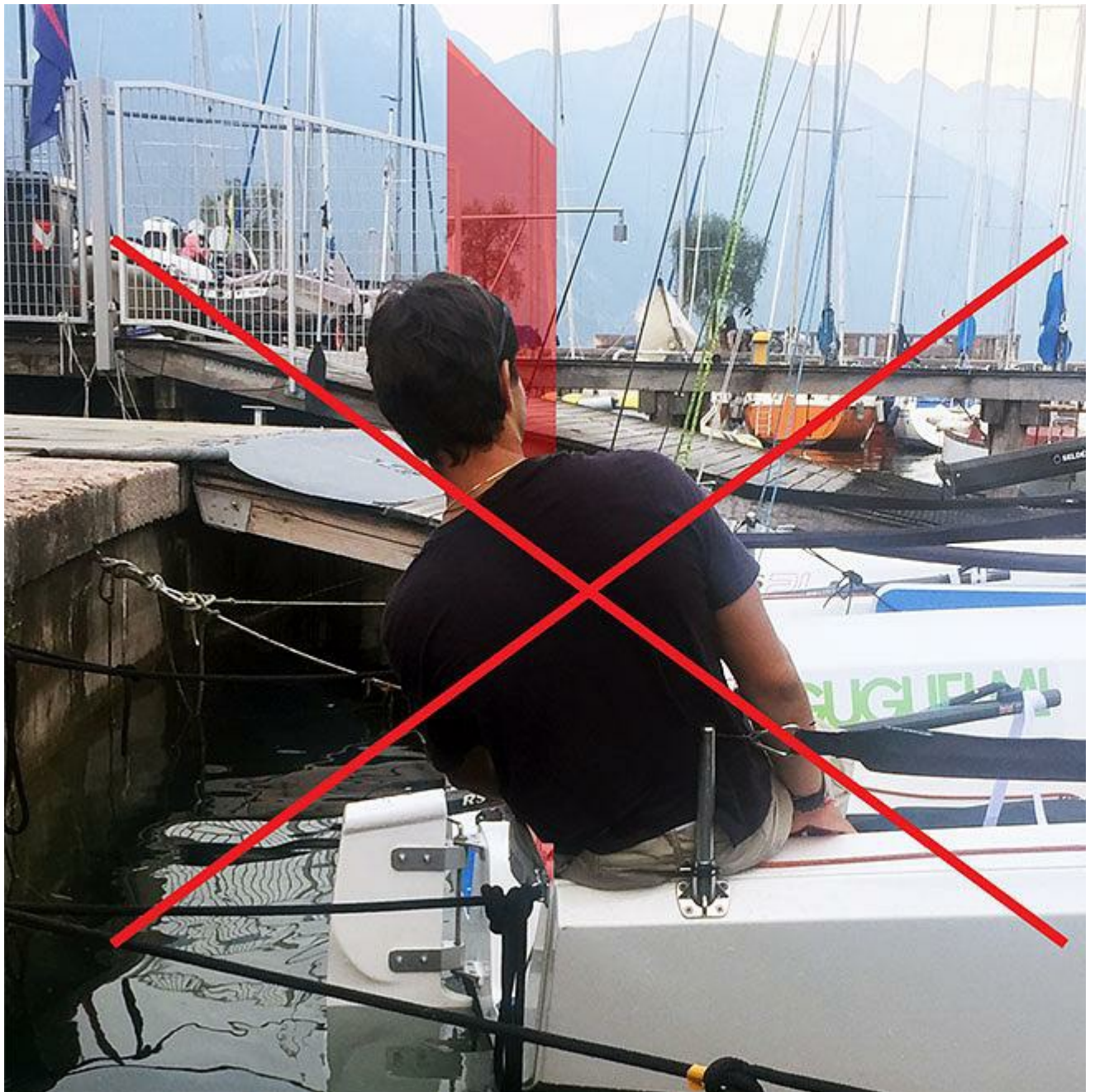
c3.3 interpretation 02.jpg 165 KB