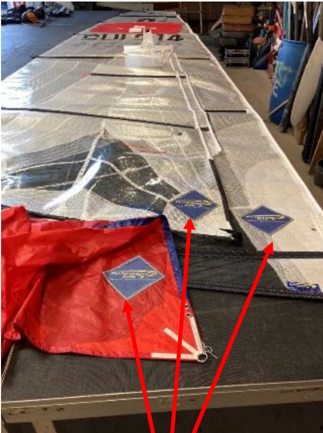
Performance Sails Logos