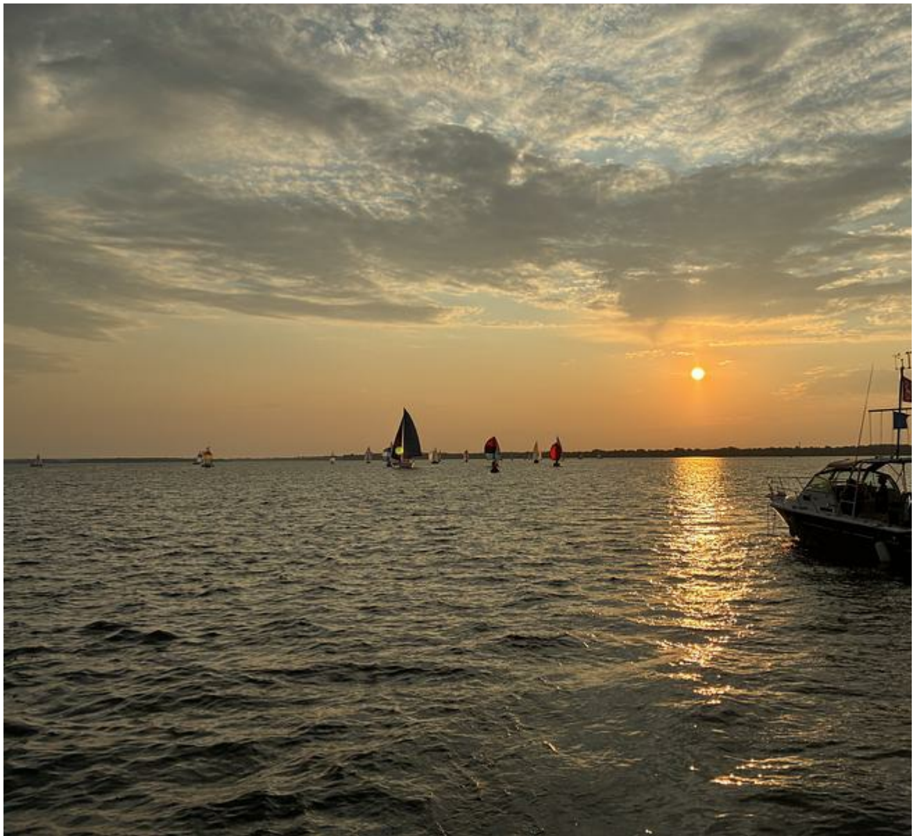
IMG_0062.jpeg 5.24 MB