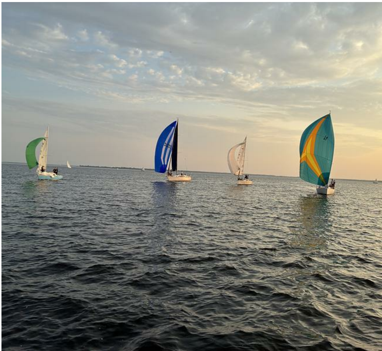
IMG_0061.jpeg 5.38 MB