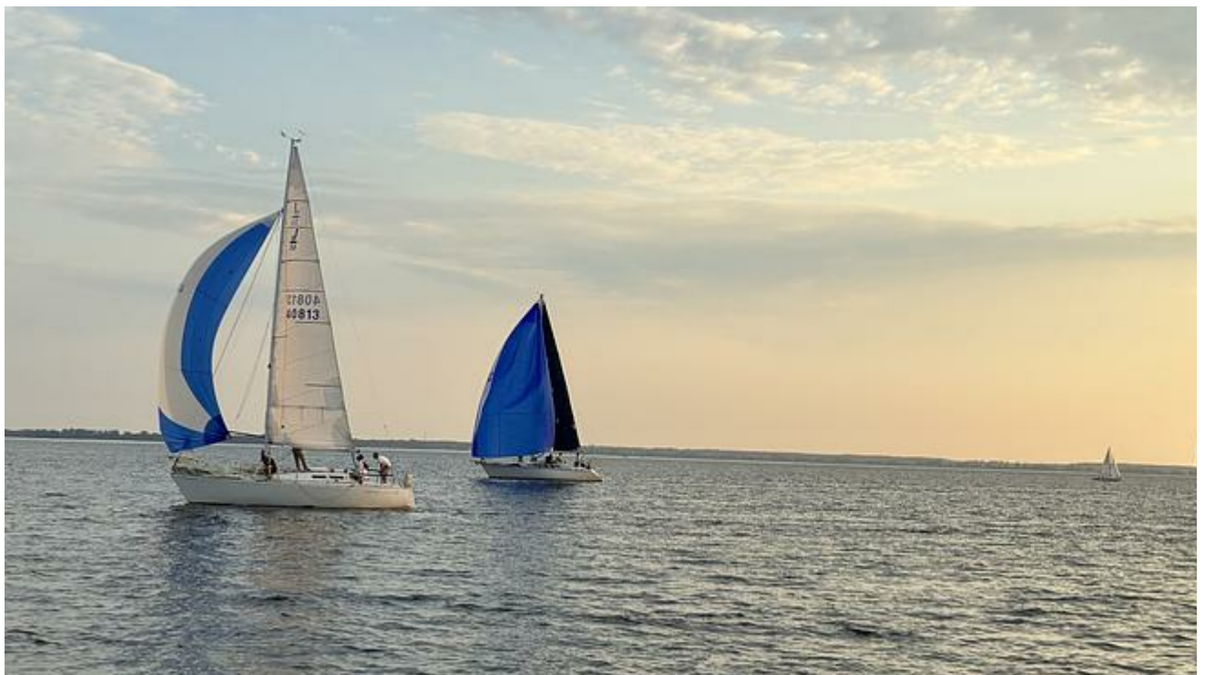
IMG_0059.jpeg 1.27 MB

I am listed as DNC, however as per attached images on that beautiful evening, fortunately I captured a number of images to mitigate this risk. See time stamp for each image, showing 'Ghost Owl' and 'Just now' behind me within a minute of "Chaos" crossing the finish line along with an image of my Chart plotter showing- my time 1:02:10, and finally a beautiful shot of the stern of the committee boat after I crossed the line, all within one min of 7:47 pm. Therefore please add my finish time accordingly. Note: It were we six boats crossing the line in short order, so the committee boat was very busy and