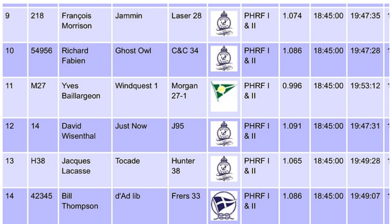
IMG_0109.png 379 KB